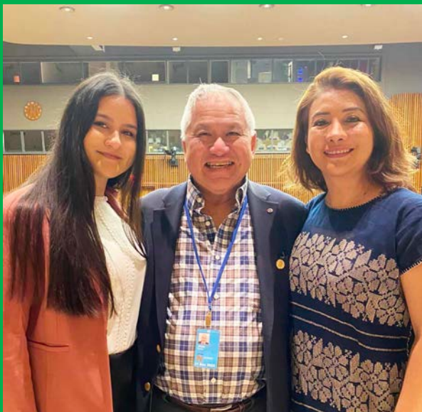
Zihuatzenjo, Mexico: City of Peace, the first of three Cities in the State of Guerrero where courageous leaders are working against the reign of violence.

International Cities of Peace is a proven partner in providing CSR relationship services to for-profit and non-profit organizations.