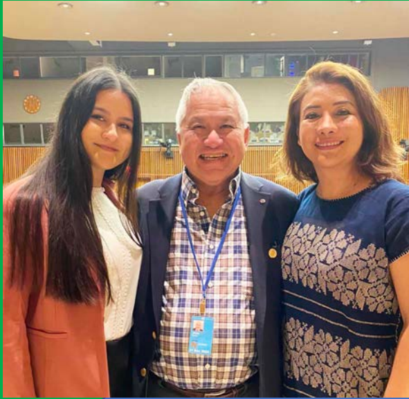
Zihuatlenjo, Mexico: City of Peace, the first of three Cities in the State of Guerrero where courageous leaders are working against the reign of violence.

International Cities of Peace is a proven partner in providing CSR relationship services to for-profit and non-profit organizations.