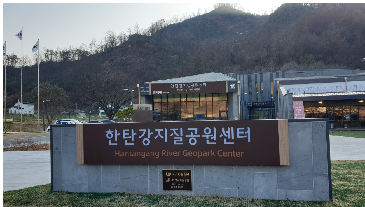
Hantangang River Geo park Center

Promotion of the cultural heritage of peace, the history of the division of the Korean peninsula, by inscribing the Hantangang National Geopark on the World Geopark List of UNESCO.