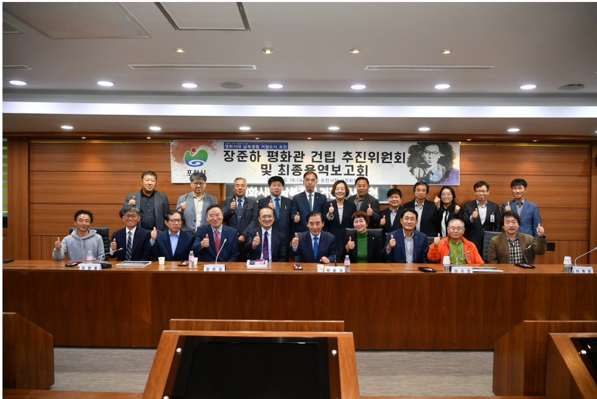
Final construction service presentation for Jang Jun-ha Peace Hall Construction Project

Idong-myeon, Pocheon-si has been promoting the construction of Jang Junha Peace Hall in order to combine the values of peaceful reunification, the independence movement and democratization with the local culture and art facilities as the historic sites where Sir Jang Junha, the symbol of the independence movement and the pro-democracy movement in Korea, passed away.