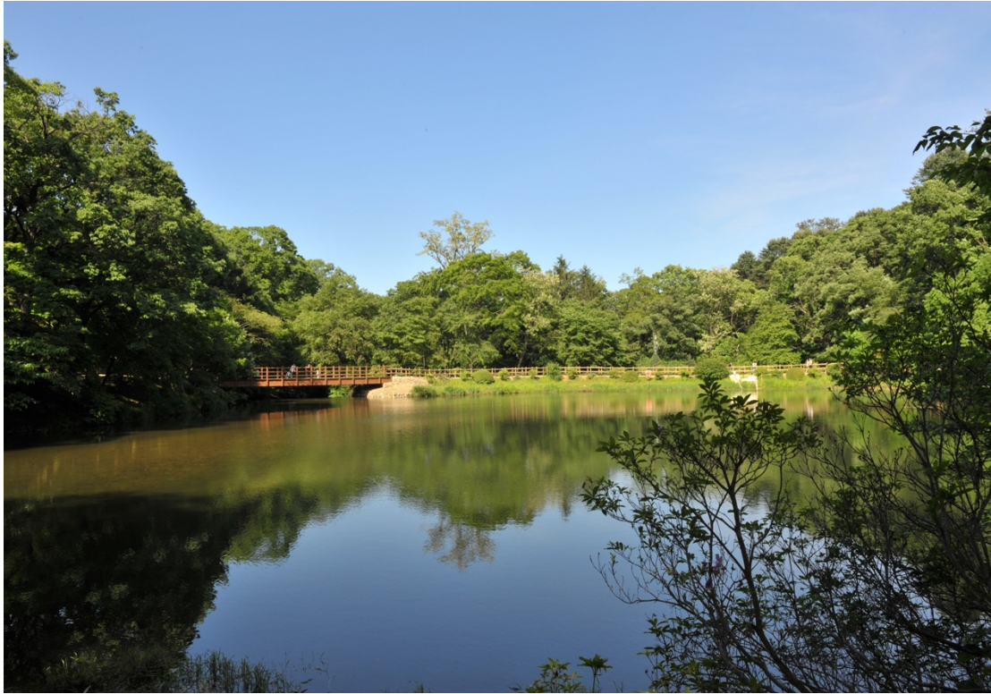
Pocheon National Arboretum

Gwangneung Forest within the Pocheon National Arboretum was strictly managed as a royal forest for over 500 years as a part of the forest included Gwangneung Royal Tomb of the 7 th King Sejo of the Joseon dynasty. In 1911, during the Japanese colonial era, the area, except the royal tomb, was classified as a 'Class A Indispensable National Forest Candidate' in accordance with the national forest survey and became the present Gwangneung Forest. In 1913 when Gwangneung Forest was designated as an experiment forest, a nursery garden was formed. In 1929, the Gwangneung Branch Office for Experiment Forest was established for the management of the forest. In January 1967, the branch office was promoted to the Jungbu Experiment Forest Office.