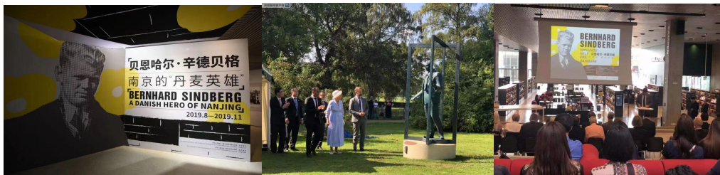
Photo Exhibition in Commemoration of the 71st

On the morning of August 31, an exhibition on Bernhard Arp Sindberg, the Danish Hero of Nanjing, was held in Aarhus of Denmark and Nanjing of east China. The statue of Sindberg was unveiled by Denmark's Queen Margre the II in the Mindeparken Memorial Park, Aarhus, on the same day. The statue unveiling and the exhibition are meant to commemorate the Danish hero Sindberg, who rescued tens of thousands of Chinese during the Nanjing Massacre, and continue to write a new chapter in Sino-Danish friendship.