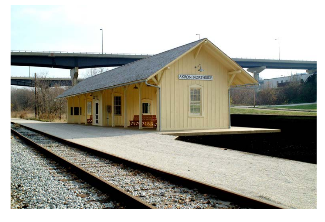
There is a train station at the edge of North Hill offering rides through the nearby Cuyahoga Valley National Park.