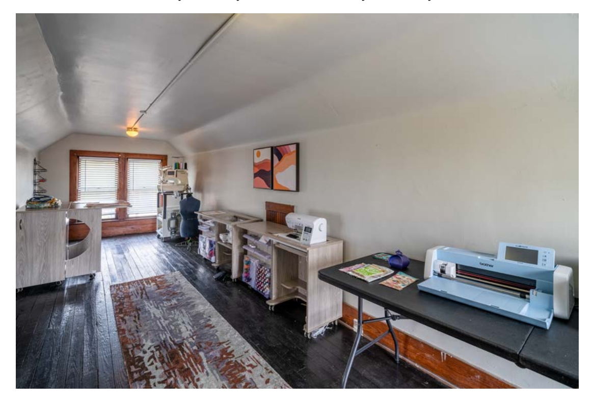
Makerspace at the Maker House.

Karen and Nepali dancers in the Exchange House getting ready and waiting to go onstage for the North Hill Music Festival by Himalayan Music Academy.