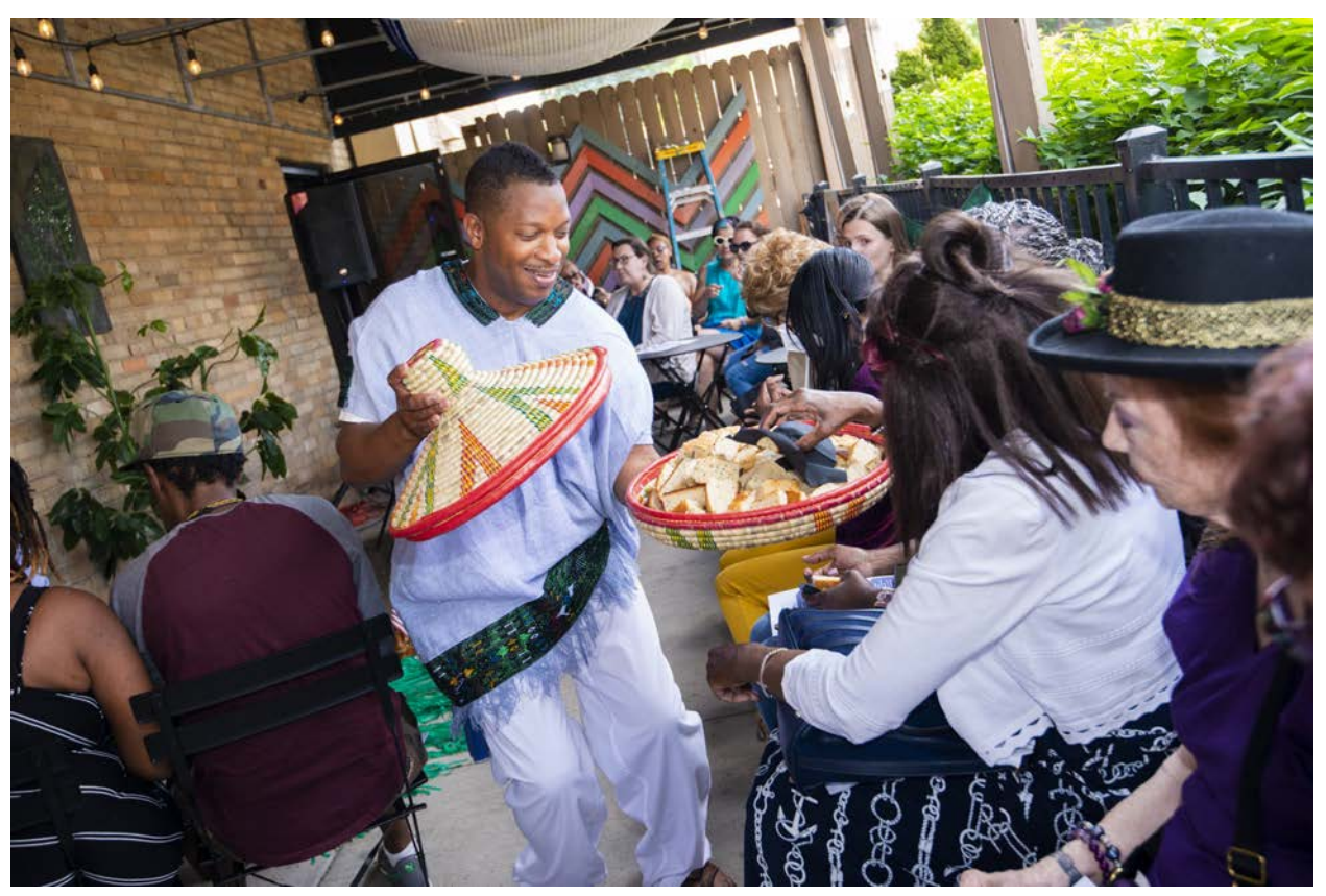
Ethiopian Coffee Ceremony at NoHi Cafe.