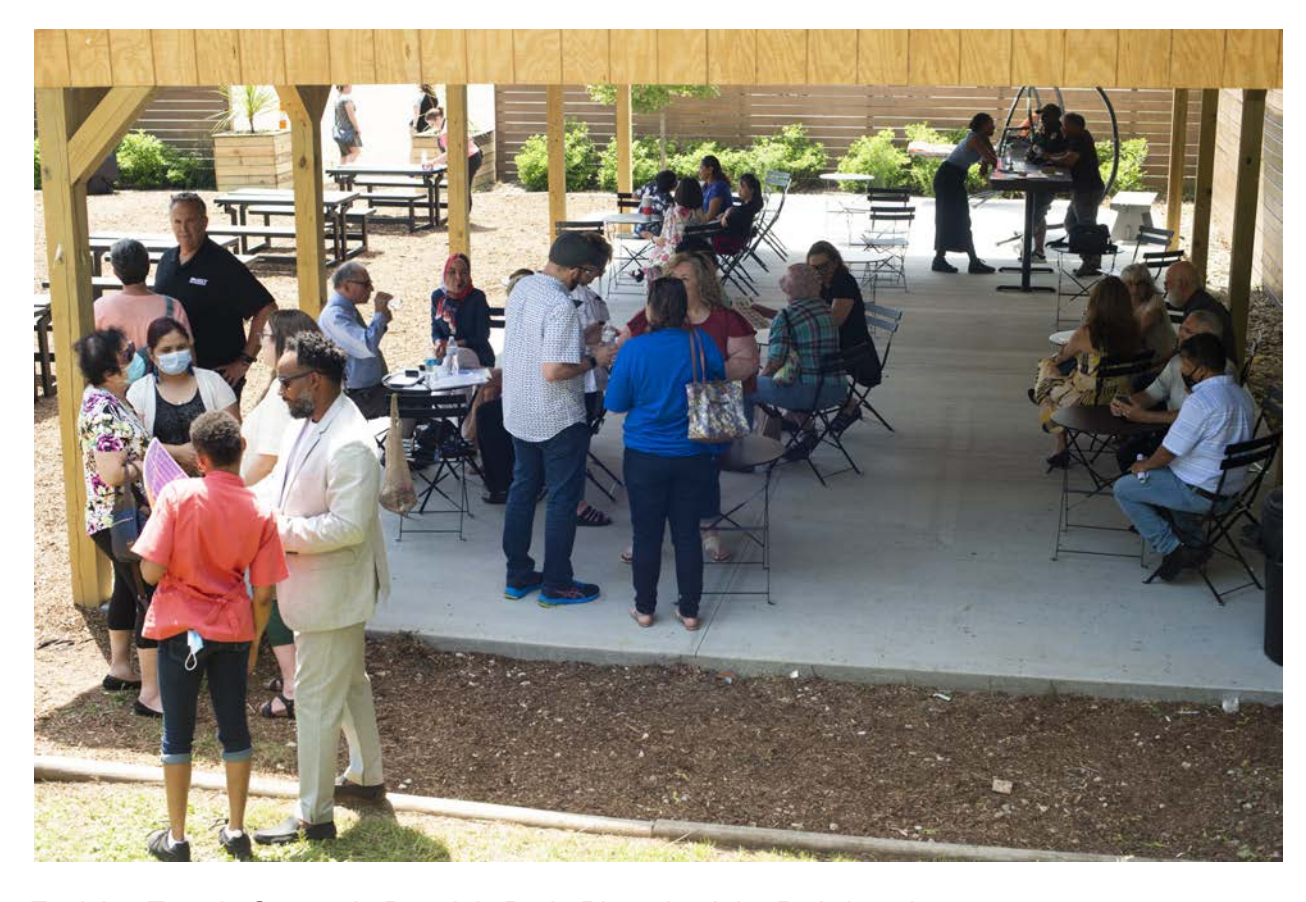
Envision Temple Square in People's Park.