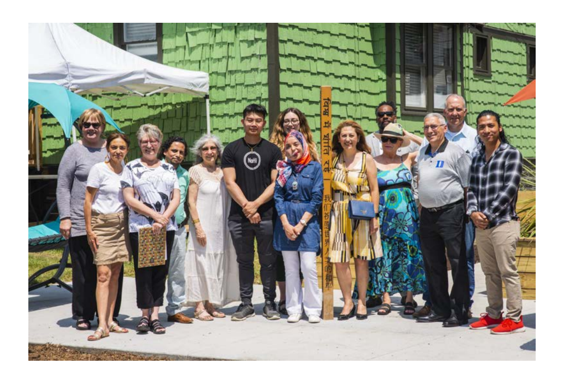
Proposal developed by North Akron Community Development Corporation (NACDC)