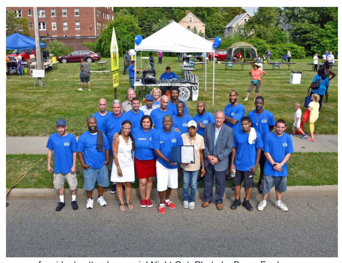
A large group of residents attend a special Night Out.