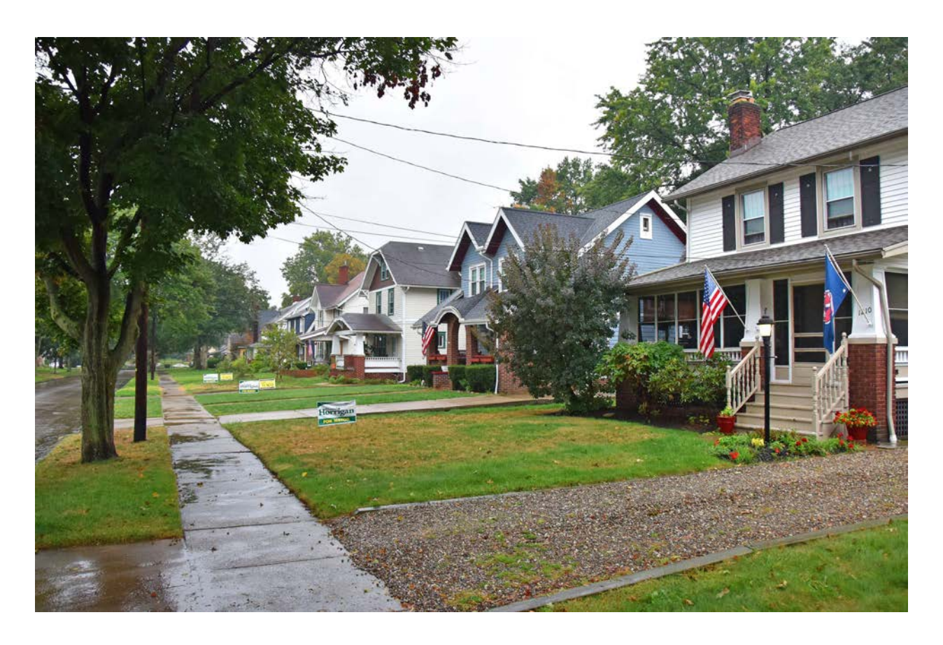
A typical North Hill neighborhood. There are many tree lined streets and expressions of patriotism.