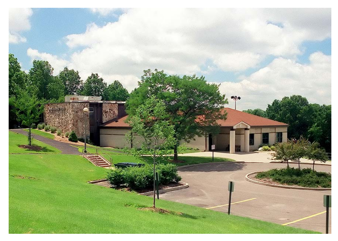
Patterson Park hosts many community programs, special events and numerous sports. There are varied programs for all ages.