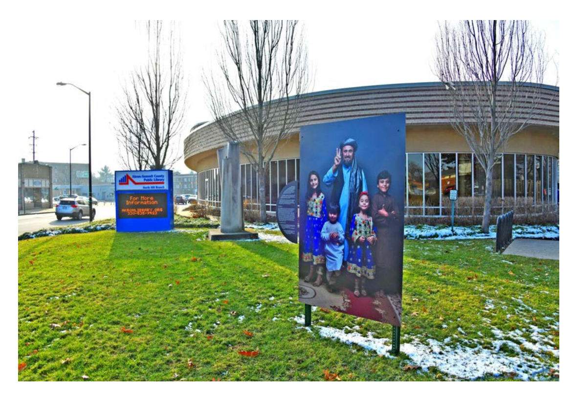
A special art project displayed multi-generations of families noting their heritage and celebrating a wide range of cultures.