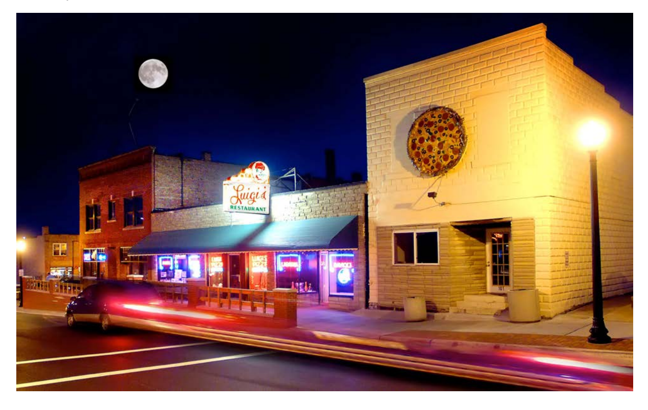
Italian food is popular in the North Hill area. Luigi's is a well known restaurant.