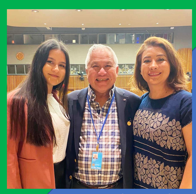
Zihuatanejo, Mexico: City of Peace, the first of three Cities in the State of Guerrero where courageous leaders are working against the reign of violence.

International Cities of Peace is a proven partner in providing CSR relationship services to for-profit and not-for-profit organizations.